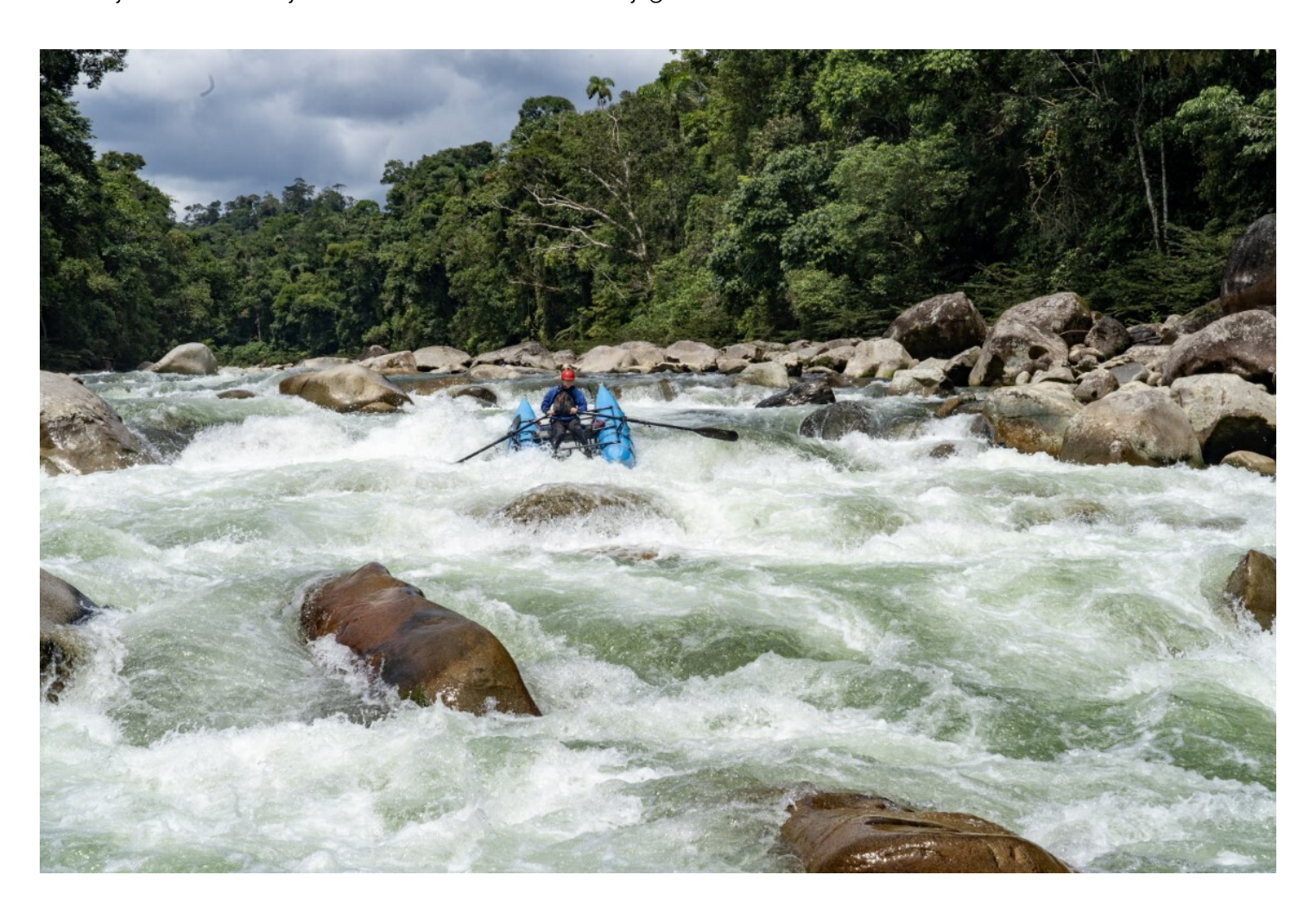
Day 5 (Thursday): Today we'll take a break and relax at the lodge, go for a hike or bike ride, or explore the local area with one of the locals from Archidona. If people wish, we can paddle a fun, scenic Class II stretch of the Rio Misahualli downstream of the lodge into Tena.

Day 4 (Wednesday): Today we are off to the Rio Piatua. This is technical Class IV/IV+ creeking with clear water and smooth granite boulders. The upper section is full on Class IV/IV+ and comes at you fast. The lower section is a classic mix of Class III+ boulder gardens with occasional harder rapids. The flow in the Piatua can change VERY quickly and we may have to find an alternate. After the river, we may grab a snack of "Volqueteros" at the Cabanas Piatua before heading back to Pacha. If they are open, we can stop at Tsatsayacu on the way back to Tena for some locally grown cacao and delicious chocolate ice cream.