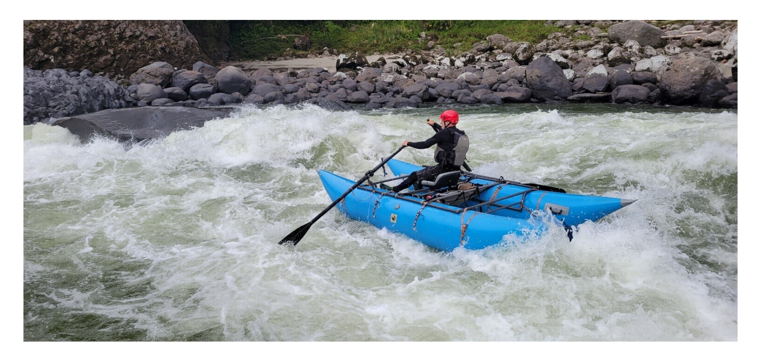
Day 7 (Saturday): After our last delicious breakfast at Pacha, pack up your gear to get ready to travel back to Quito. A private van/truck will transport the group back to the Quito airport. We shoot for leaving Pacha around noon, with plenty of time for an evening drop-off at the airport. It may be possible to stop at Papallacta Hots Springs on the way for a soak ($10 per person). Lunch is not provided.

Day 6 (Friday): Today is a big day on the Rio Quijos, putting in Bridge 4 or at the Sardinas Grande and running the El Chaco, and Bombon sections. In the El Chaco section, there are powerful Class IV/IV+ pool-drop rapids like El Toro and a spectacular mini gorge where the columnar basalt has been twisted in several directions. Once we reach the confluence with the Oyacachi (there are some sticky holes here!) we enter the Bombon section where the rapids ease a bit (Class III-IV). Bombon has more pool drop rapids with one rapid of note. "Curvas Peligrosas" is an S-turn with big boils at the top and a couple of big holes at the bottom. Below Curvas, there is another beautiful, but short basalt gorge. The last rapid, Chuchaqui (meaning hangover) has a great wave train. We'll get back to Pacha in time for dinner.