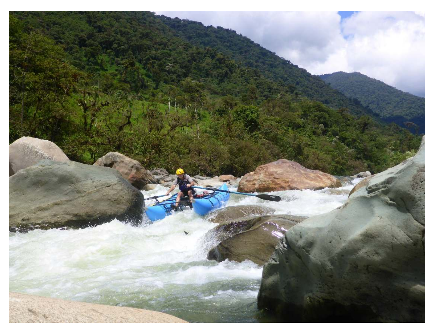
7-DAY CLASS IV/IV+ ITINERARY (NAPO and QUIJOS VALLEYS) $1350 per person Plus Equipment Rental. This trip can be run with a minimum of 2 people (sharing a cabin) for $1600 per person.

This year we are offering a cataraft, inflatable kayak, and hardshell trip for advanced rowers/paddlers. On our Advanced Whitewater Trip you can expect to run some of Ecuador's best Class III+ toIV+ runs in the Napo Valley (Archdona) and the Quijos Valley (Baeza). What could be better than a week of challenging whitewater in a tropical paradise? Some of these runs are very challenging and have legitimate Class IV and IV+ rapids , some of the IV+ rapids would be considered Class V in our USA guidebooks.