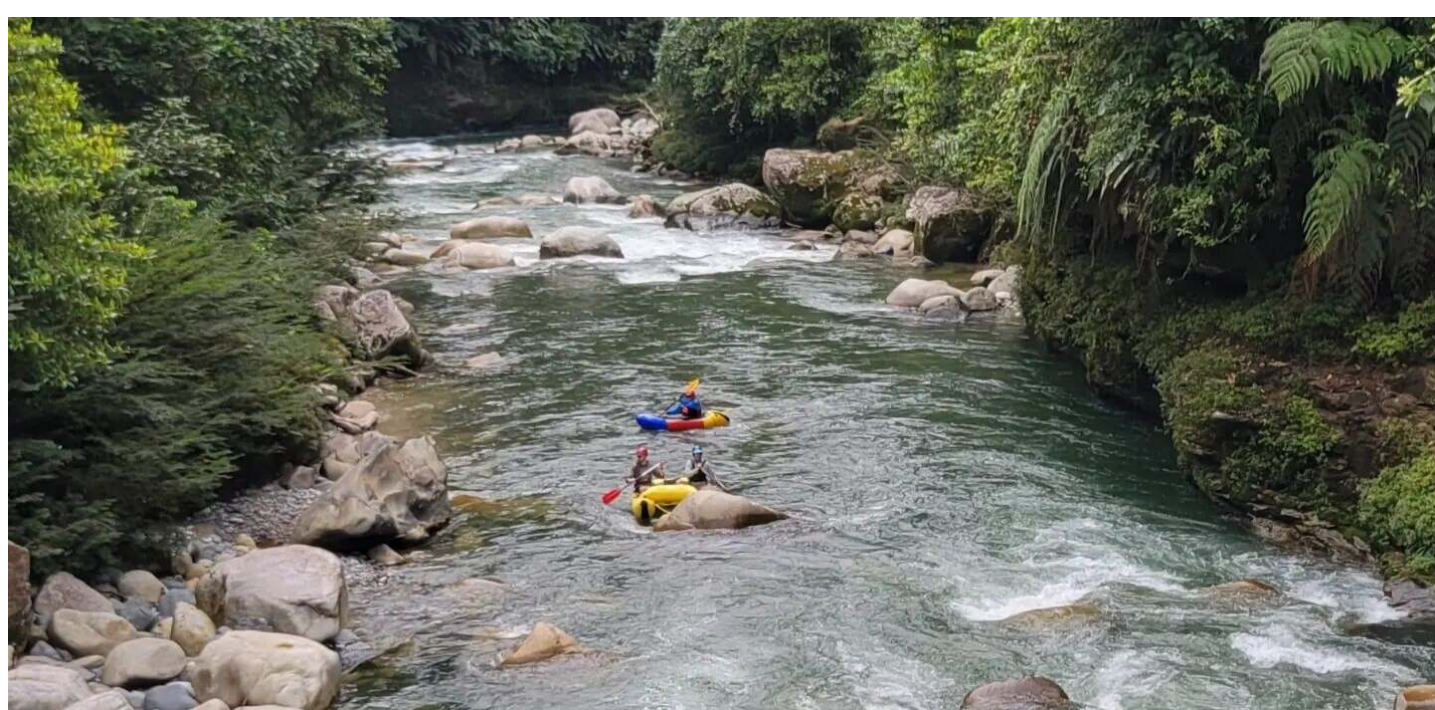
2024/2025 Class IV Itinerary