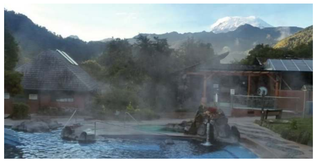
2024/2025 Class IV Itinerary