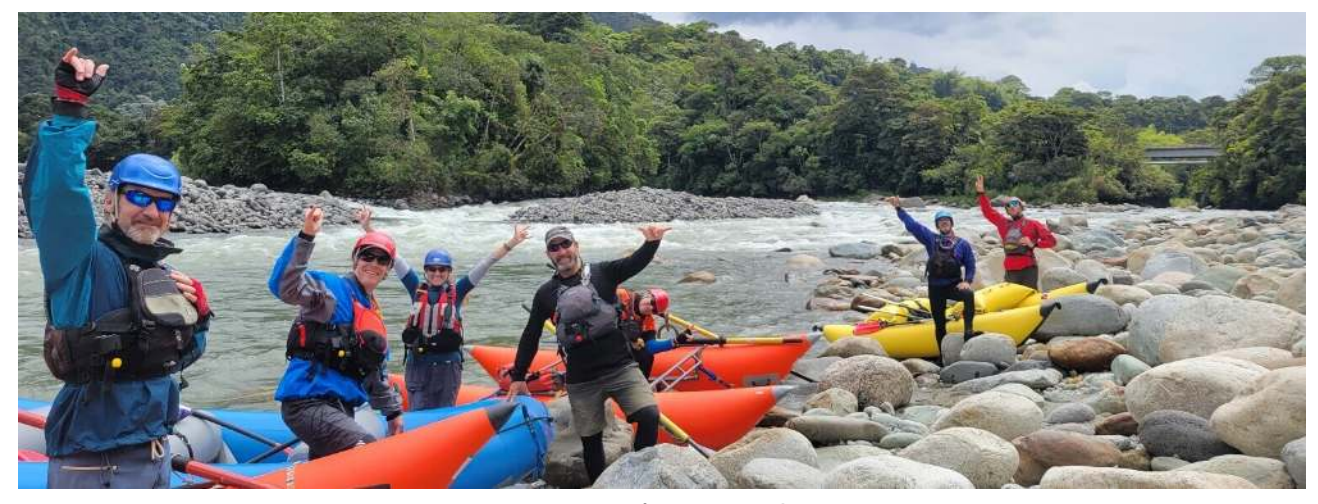
2024/2025 Class IV Itinerary

We also strongly recommend purchasing a travel protection plan that includes trip cancellation and interruption coverage, baggage loss protection, emergency medical and emergency medical evacuation coverage. A travel protection plan may help reimburse the cost of your pre-paid, non-refundable payments in the event you are prevented from taking your trip for a covered reason. Personal items and cameras are carried entirely at the owner's risk, and we accept no responsibility for lost or damaged property.